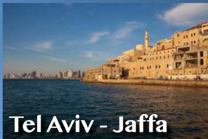
Tel Aviv - Jaffa