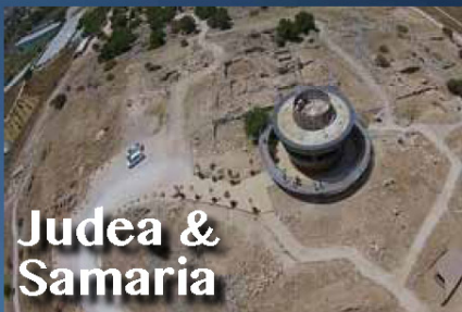
Judea & Samaria