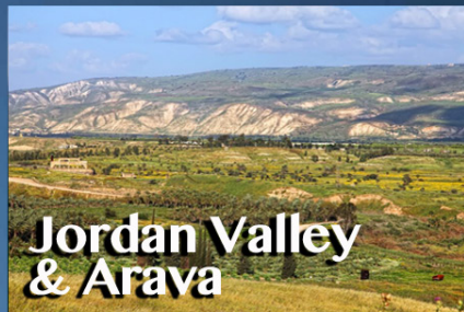
Jordan Valley & Arava